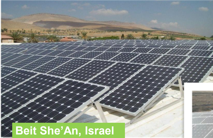
Beit She'An, Israel