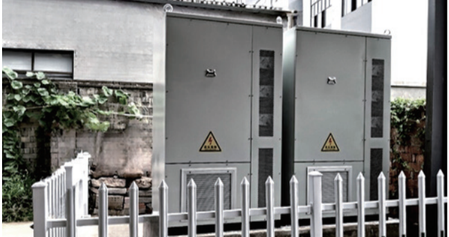
Figure 1: Project Photos