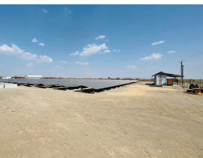
Figure 1: Project Photos