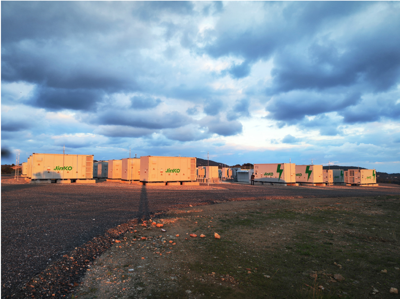
Fig. 2 On-site Photo

Jinko's BESS solution plays a critical role by enabling on-site solar energy to be stored and used exclusively for self-consumption, reinforcing the AIA's leadership in sustainability. From January 1, 2026, AIA's electricity needs were covered solely by clean, renewable electricity produced within the airport fence for self-consumption—making AIA the only airport in Europe to cover 100% of its electricity needs exclusively with on-site clean energy.